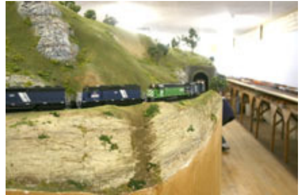
A train makes its way up the grade towards the summit on the GEHAMS HO layout