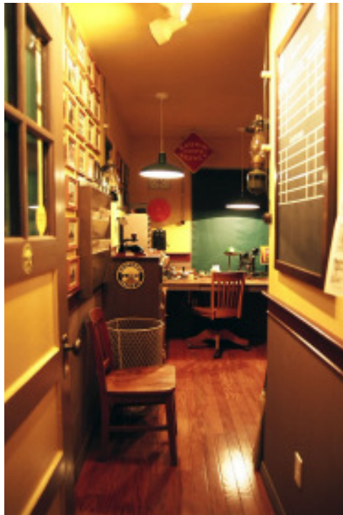
Dispatcher's Office in the SP Museum