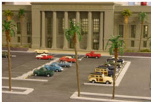
Bakersfield Union Passenger Terminal on the GEHAMS N-Scale layout