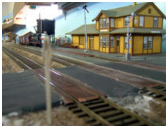
SP Depot on Larry Saslaw's Layout

The third layout is Larry Saslaw's HO scale layout, depicting Southern Pacific's route over Dunsmuir, California. Larry has scratchbuilt several of the structures on the layout from actual plans of the Southern Pacific's structures located at Dunsmuir, including the roundhouse.