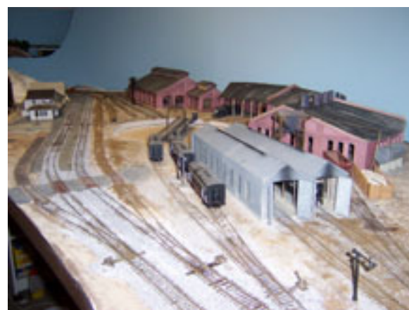
Engine Terminal on Larry Saslaw's SP

The fourth tour is the Southern Pacific Museum, founded as a tribute to one of the greatest "fallen flag" railroads of all time. It is modeled after a typical Southern Pacific Number 22 station of 1939. The artifacts seen are all operational, and the colors are authentic for the period. As a work in progress, the museum is continually changing as more artifacts are added. The "station" is in an old bedroom of a house that was converted to represent the interior of a Southern Pacific depot.