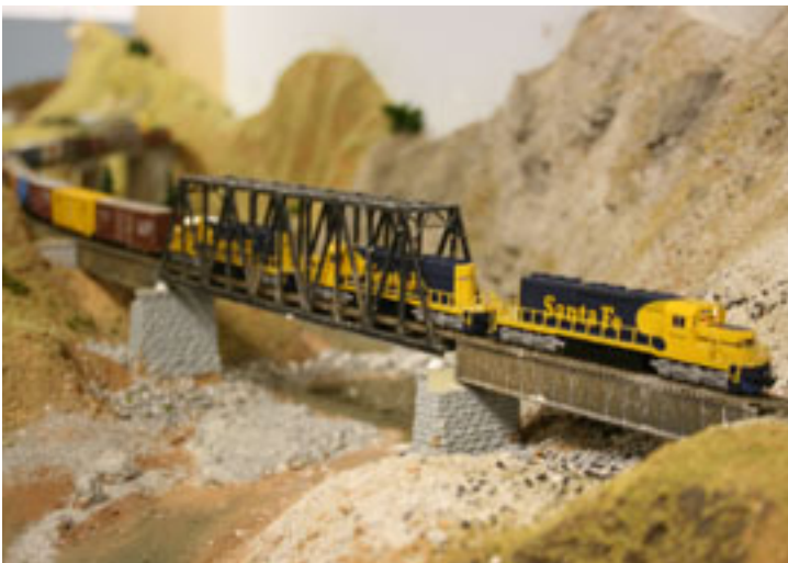
A Santa Fe mixed freight crosses one of 5 Feather River bridges on the GEHAMS N-Scale layout

it might be different for them to actually show you and explain to you how they do their scenery. So, these clinics will be presented to you in the aisle ways of the N scale layout, instead of in the comfort of your chair. That way, you won’t be tempted to fall asleep in your chair!