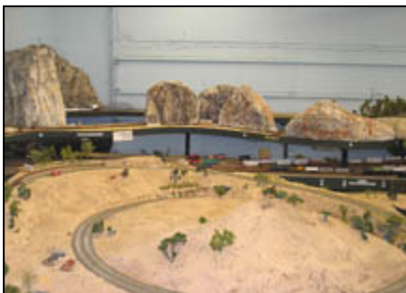
Overlooking Tehachapi loop on the Goshen and Goosechase.

Gary Saxton's New York Ontario & Western - Featured in Model Railroad Planning 2003, this N-scale layout models the 200 miles of New York Ontario and Western between the Hudson River and the anthracite coalfields around Scranton, PA. This is your chance to stand inside a 7 layered helix where 4 of the layers are up and running. Control is by North Coast DCC. Originally build in the dining room of the house in Houston, TX, and recently moved to Clovis. See the layout now and compare with the website ( http://home.swbell.net/gary46/ ) pictures taken in Houston.