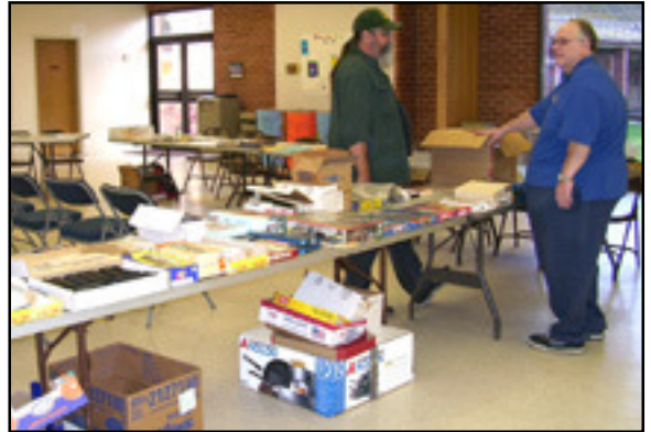
Auction items filled two tables.