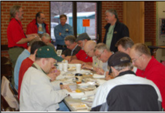
Daylighters dig into Brewster's clinic to build HO and N-scale laser-cut buildings.