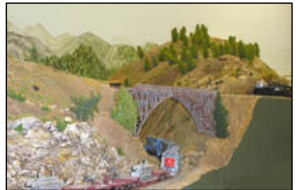
A scene on the Goshen and Goosechase.