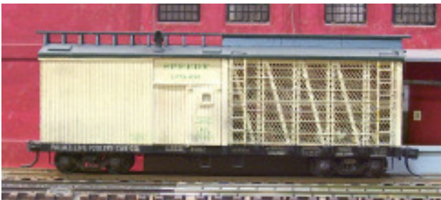
This Chicken Car is a superdetailed kit...The builder added chickens inside and replaced the kit grabs and other details with commercial details

AP Merit Award judging can be done in one of two ways: 1) at an NMRA-sponsored contest at a convention or meet; 2) arrange for judging at another time separate from a convention or meet. You can bring your work to the judges location, or they will even come to you! When you're ready to have your models merit judged, contact the Daylight Division AP Chairman (me!) to setup a time and place. My contact information is listed on the first page of the Observation and on the Daylight Division website at: http://www.pcrnmra.org/daylight/callboard.htm