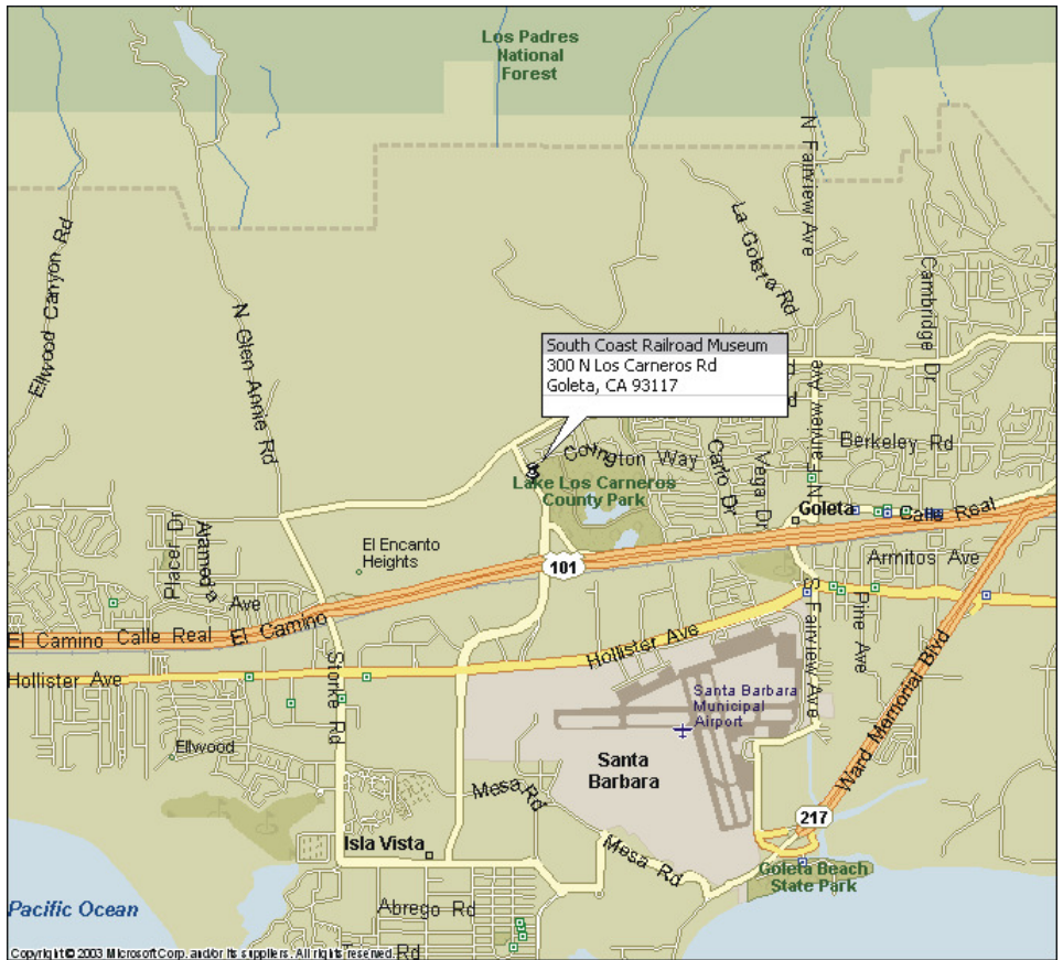
Map to the Meet