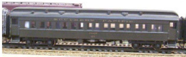
You will need to exhibit at least one passenger car

What's a “car”? A “car” is just about anything that runs on rails and is NOT self-propelled (if it's self-propelled, it's Motive Power). This includes freight cars, passenger cars, maintenance of way cars (including equipment such as cranes), cabooses, cable cars, unpowered (dummy) locomotives, etc. Actually, if you have a model which is self propelled, but is a model of something that was designed to carry something (besides itself), such as a rail car; it can be used as one of the qualifying models for Motive Power or Cars, but not both.