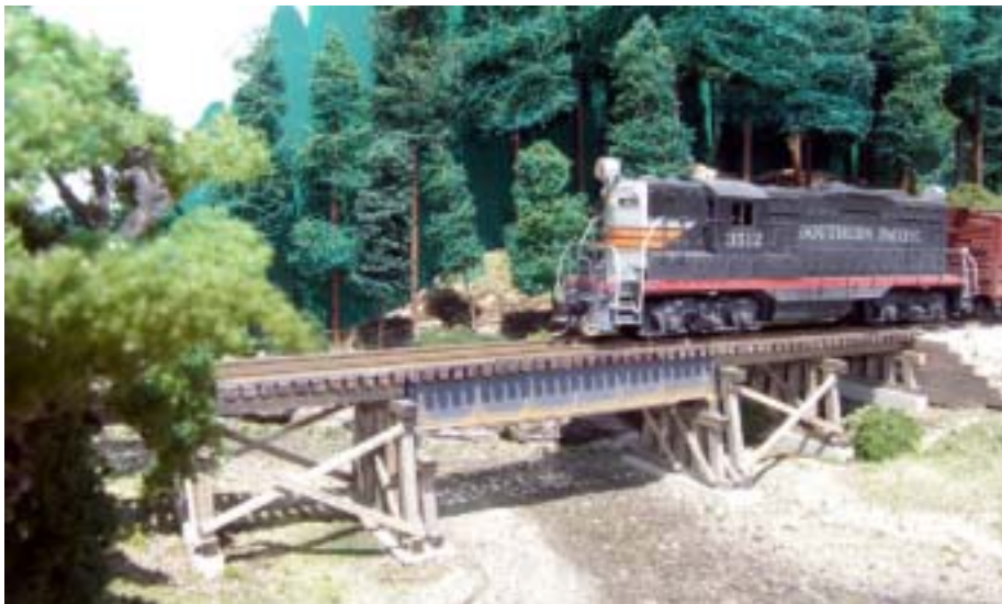
The results of Bob's shallow creek project are proof of the process.

Trees are my favorite scenic element, and conifer trees are my favorite type. A simple way to make surprisingly realistic pine, fir, or cedar trees uses furnace filter material and bamboo skewers. For me, the key to the method is to tease the filter apart as much as possible and then to affix some finely ground foam rubber (Woodland Scenics fine turf or equivalent) so as to create lacy, see-through foliage. At 15 minutes labor (and less than 15 cents cost) for a tree about 12 inches high, it was easy to fabricate the scores of trees needed to suggest a heavily wooded hillside.