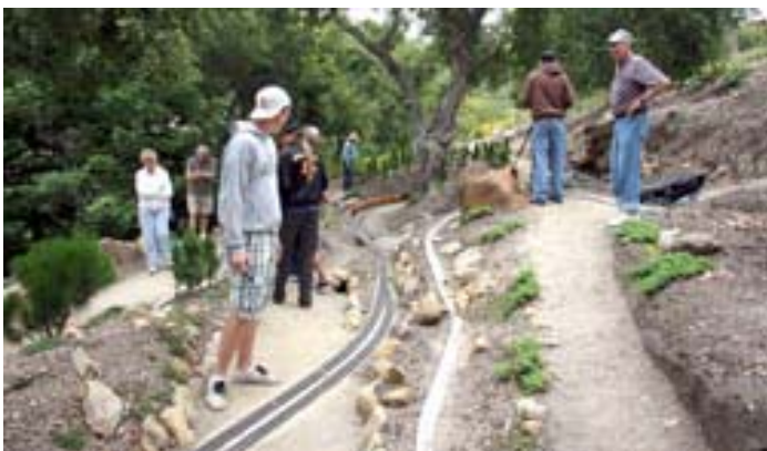
Operators and railfans are ‘Waiting for Clearance’ on Gary Siegel’s railroad. The hillside layout is exceptional and was an adventure to railfan.