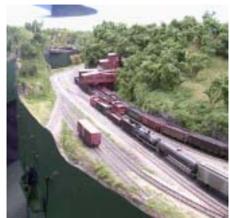
The coal loading operation on Gary Siegel's HO layout.