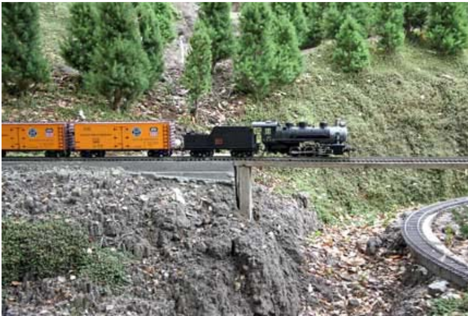
Photo at left. An O-6-0 drifts down-grade leading a unit train of reefers on Gary Siegel’s outdoor G-gauge layout. The layout winds through an extensively landscaped hillside.