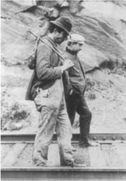
Two hobos walking along railroad tracks, after being put off a train. One carries a bindle.

People have been sneaking rides on trains from the beginning of railroads. But, it's always been illegal and very dangerous. No one knows how the term "hobo" started. Some think it came from "hoe boy" because early hobos often carried hoes for working. Others think it came from an old greeting, "Ho beau."