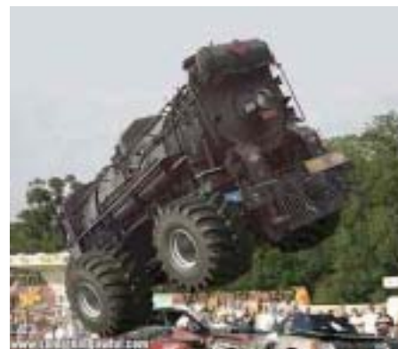
Could this be a rare 0-4-0 Berkshire Flyer?