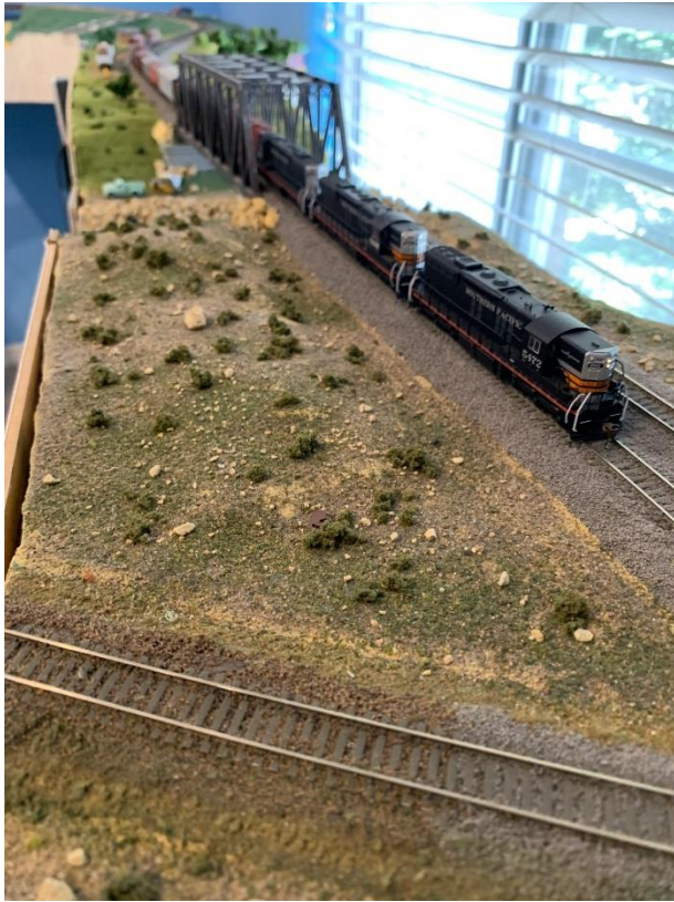
3 Southern Pacific SD9's rumble over the Kern River on Steve Lowe's Tehachapi-Loop-themed N scale layout, included on the layout tours at the Daylight Division meet May 14.