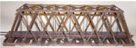
This Campbell bridge is a craftsman kit that would fulfill the bridge requirement..