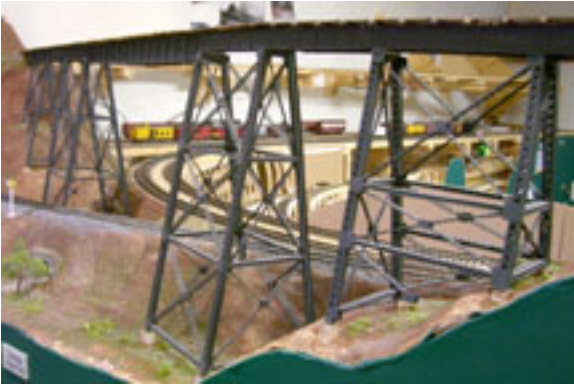
This trestle would also fulfill the bridge requirement.