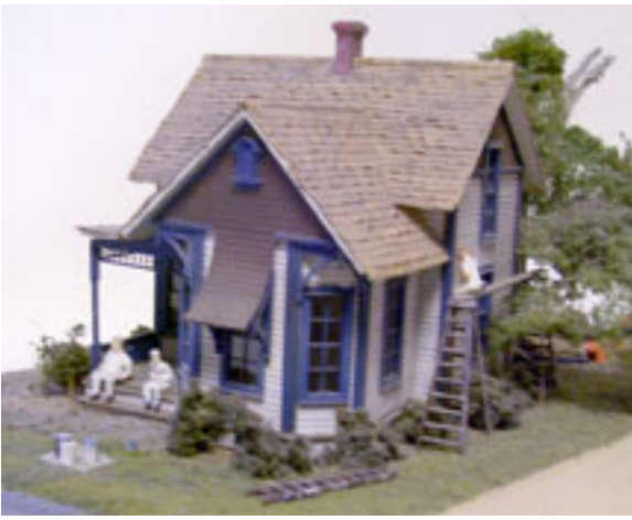
This kit-built cottage is an example of one type of structure that can be submitted for this certificate.

Note that you can use commercial scribed wood or styrene and still meet the scratchbuilt requirement. If you make your own plans, be sure to document