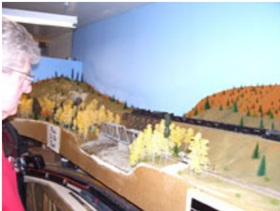
John Houlihan admires the narrow gauge portion of Richard Cantrell's layout during the Spring 2007 Meet

There are 2 model train stores in Tehachapi — Trains, Etc., and Gold Coast Station. Trains, Etc. is located on West Tehachapi Blvd, and right across the street from Trains, Etc., is Gold Coast Station,