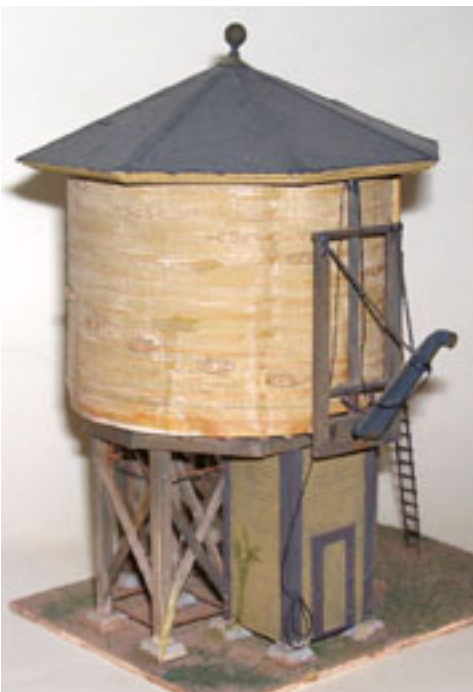
This craftsman-kit water tank can be considered super-detailed.

that so you can earn extra points for it.