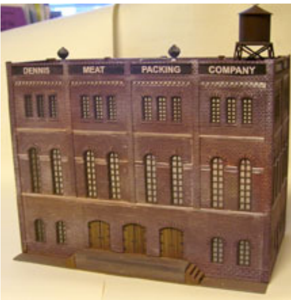
This plastic building that has been "kit-bashed" could qualify as a non-scratchbuilt entry.