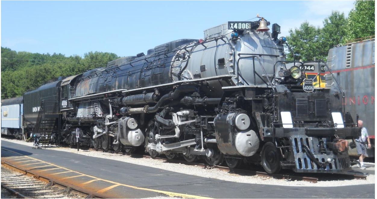
UP Big Boy number 4006 at the National Transportation Museum in St. Louis

Bruce's article continues in our next issue