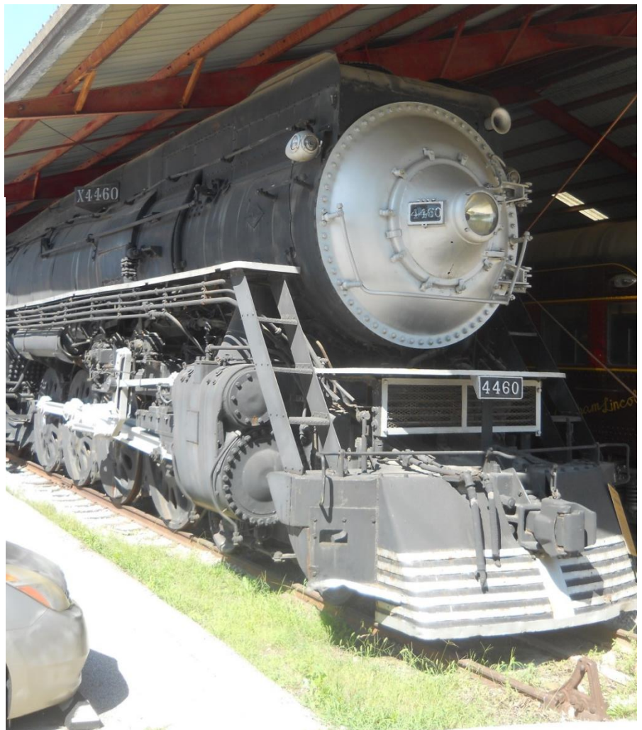
Southern Pacific 4460, a G-6, at the National Transportation Museum

This year I wanted to join the prototype tour to the National Transportation Museum because they have a Southern Pacific G-6 4-8-4 – one of the last big passenger steam engines built for my favorite railroad. When I went to sign up they were already sold out. Not to fear. Since we drove to the convention, I used our car and drove myself and thoroughly enjoyed my visit.